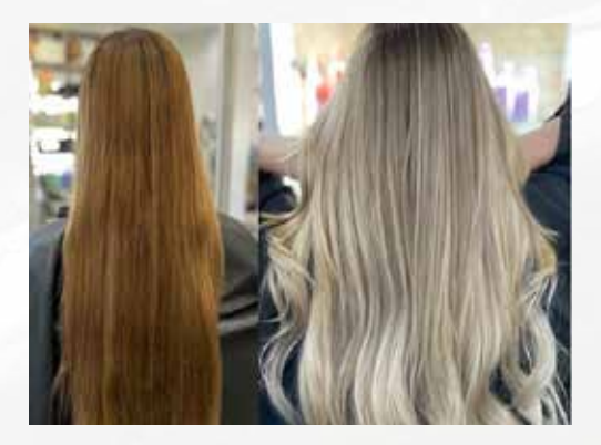
Neutralize metals for a clean lift. @victoryhairmaplewood