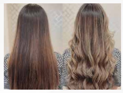
Reduce split ends and fill. @glambydrea_